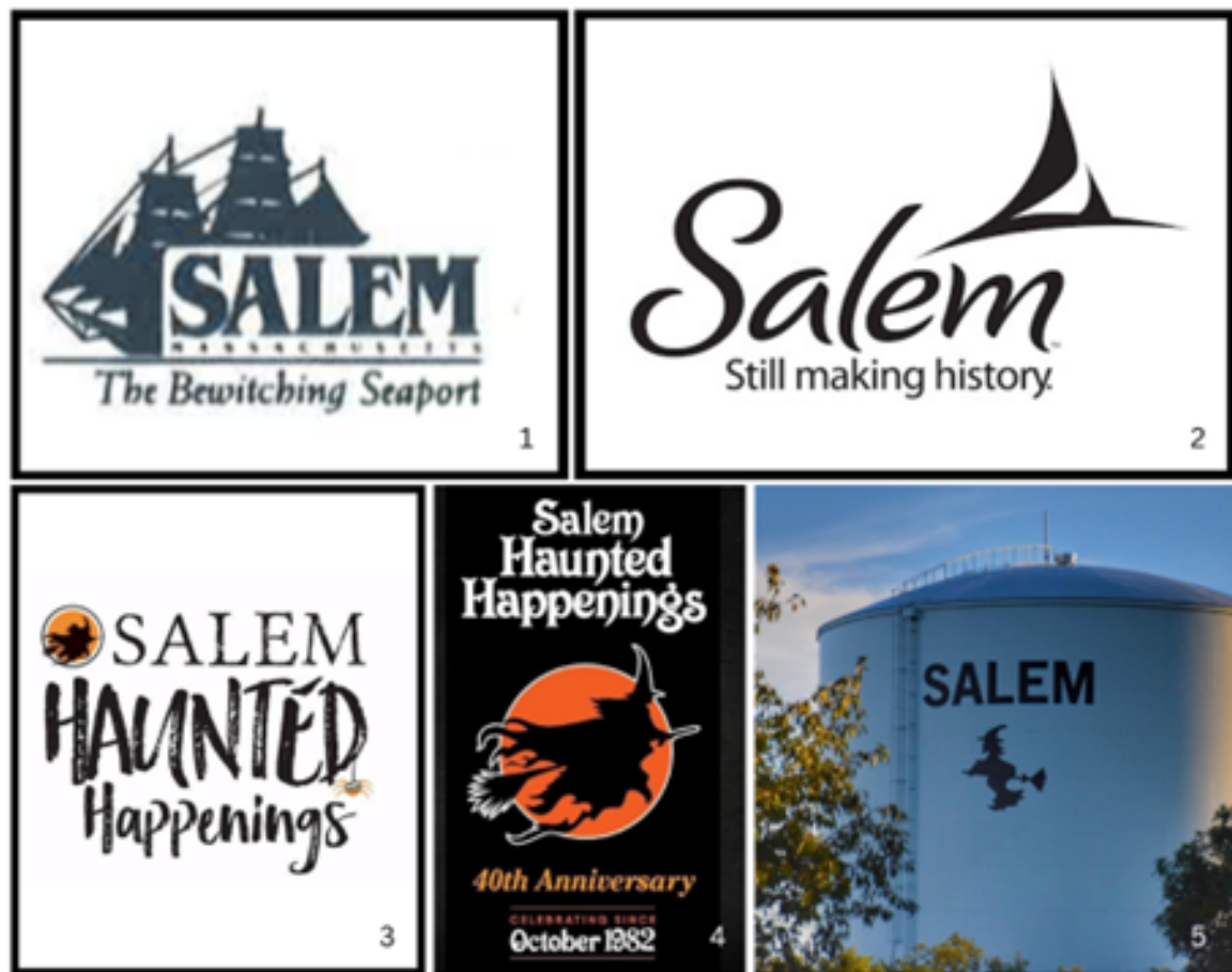
Figure 2: Semiotics of the supernatural in Salem, MA, USA

1. Salem's Destination Branding Pre-2012: Fox, 2019; 2. Salem's Destination Branding Post-2012: https://www.salem.org/ ; 3. Salem Haunted Happenings [digital]: https://www.hauntedhappenings.org/ ; 4. Salem Haunted Happenings 40 th Anniversary [print]: https://www.instagram.com/p/ChDcW7QOwxS/ ; 5. Salem Water tower: https://www.instagram.com/p/BKPCypagjoC/