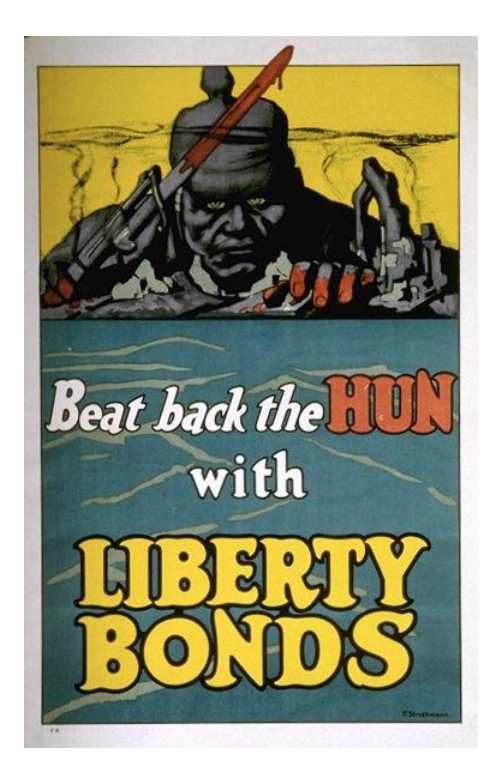
F. Strothmann (1918). Courtesy of the Imperial War Museum Art.IWM PST 0235.

In a mostly greyscale characterisation, the man's eyes glow green from beneath his hat, and his fingers are dripping with red blood, as is his brandished dagger. The man appears to be a giant, crawling through the debris of Europe towards an ocean. The American public is exhorted to buy 'liberty bonds' to 'beat back the Hun'. Here, the Germans are renamed after the 5<sup>th</sup> century nomadic tribe that was characterised in myth as being of short stature and barbaric intent that is often aligned with subhuman monstrous beasts. One of the challenges faced in recruiting was just how to make the German's 'other'. The ties between Britain and Germany, and particularly America and Germany with its strong tradition of immigration from that country, had to be violently broken. This poster below, also American (designed by R. Hopps in 1917), shows a similar strategy but with the German soldier completely dehumanised.