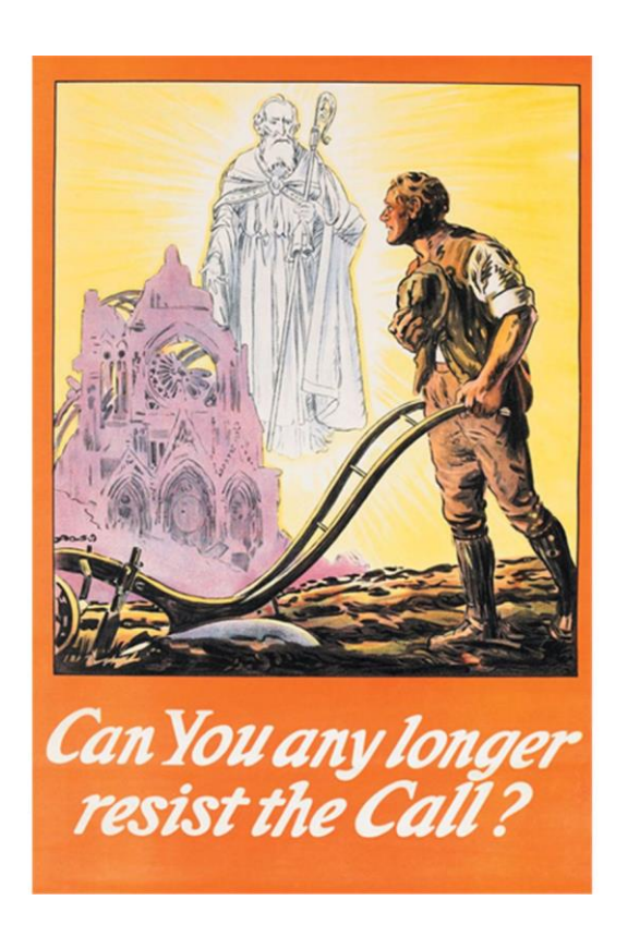
Unknown artist (1915). Art.IWM PST 13637

Religious iconography is not restricted to the use of angels. For example, one British poster from 1915, when voluntary recruitment was trailing off, particularly in Ireland, shows a farmer at his plough (itself a religious metaphor), against the backdrop of a ruined cathedral (recognisable as the medieval Rheims Cathedral, which had been destroyed in the early months of the war). The farmer looks up from his plough to see the ruin with the spectral figure of St Patrick emanating light and carrying a shepherd's crook. The use of recognisable saints, along with angels, is found in many posters produced early in the war.