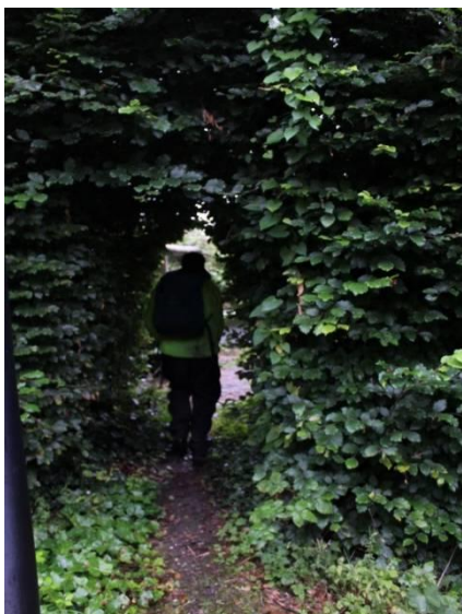
Figure 7: Forest Farm (daytime): entering the bower...