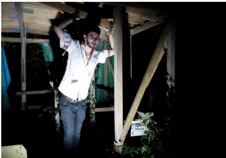
Figure 16: The victim chained to the crossbeam... (Scott Ridley)

immersing audiences into the world of popular, doom-laden horror. There are a few moments of amusing banter with the audience, wherein the gypsies look for appropriate ‘subjects’ for their moonlit ritual, rejecting various candidates for being ‘too young...’ or ‘too unhealthy...’