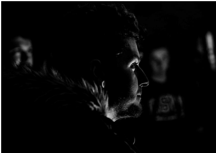
Figure 12: The story of the well...