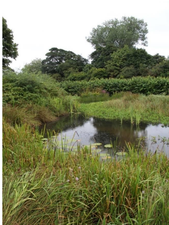
Figure 25: Forest Farm (daytime): the meadow and ponds

Don’t panic, we’re perfectly safe... What an amazing thing to witness...! The legends must be true!