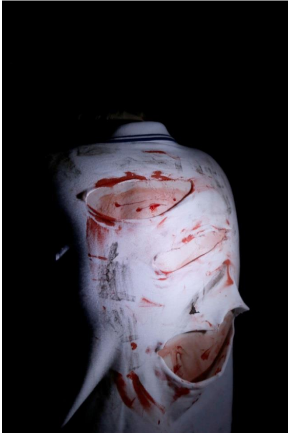
Figure 9: He turns his back...

been mauled (Figure 9). The wound might be a clue as to what is to come: only one kind of creature could have caused those slash marks... The fact this remains unsaid is a storytelling