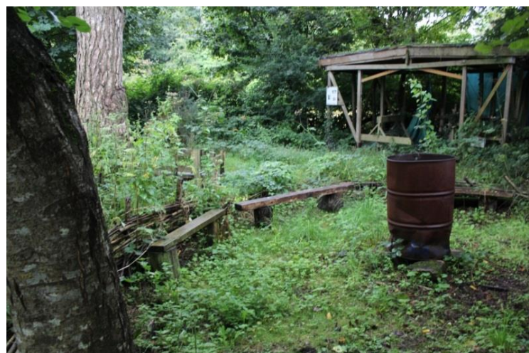
Figure 14: Forest Farm (daytime): the open area with brazier

moment of suspense, this was disarmingly comic. This is another example of the Grand-Guignolian douche écossaise : partly a moment of light relief, it also had an important experiential function: regardless of the disarmingly cheerful guide, the audience must now be aware – with disquiet or delight – that they