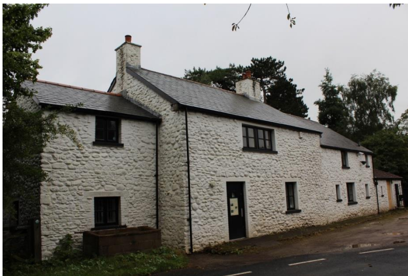
Figure 2: Forest Farm (daytime): the farmhouse

The audience arrives at the Forest Farm carpark and are led by lantern down the closed public thoroughfare. On one occasion, a toad crawling across the path to the shock of some visitors is an unexpected but invaluable impromptu moment. Indeed, this surprise amphibian