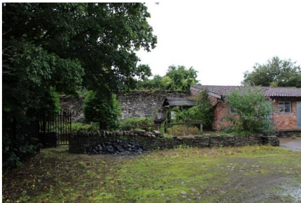
Figure 18: Forest Farm (daytime): the courtyard

The audience walks onto the courtyard's patterned cobblestones (Figures 18 and 19) and a new guide closes the gate behind the audience, which – in another arresting sonic moment like the well's iron cover – groans shut and then reverberates loudly. In the courtyard are a group of eight dancers in green caped gowns who have been dancing for a few minutes before the audience arrive. Indeed, audience may have already heard their pounding feet for