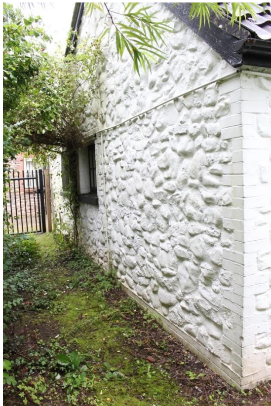
Figure 4: Forest Farm (daytime): turning the corner...

Only a minority detect the ‘apparition’ but those who do discuss it, causing a mood of