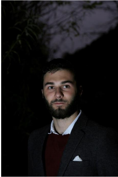
Figure 6: ‘The story of Forest Farm...’ (Luke Rose)

forms a natural cage and the audience are led inside. Two storytellers greet the crowd and recount the story of the Farm (Figures 5 and 6). A seemingly factual account of the farm’s owners, the Sullivans (a deliberately fictional invented name), begins to shift into the uncanny: the audience is told of a fire that happened in the 1940s (which, as some locals might know, did happen) that killed all the residents (in fact, no-one died). This was an example of effective uncanny storytelling: the real becomes gradually distorted. During Halloween, the truth need not get in the way of a creepy story. After this tragedy, when the farm was rebuilt, Mr Sullivan was seen working on the farm, well-dressed ‘in a suit with a purple flower’, despite