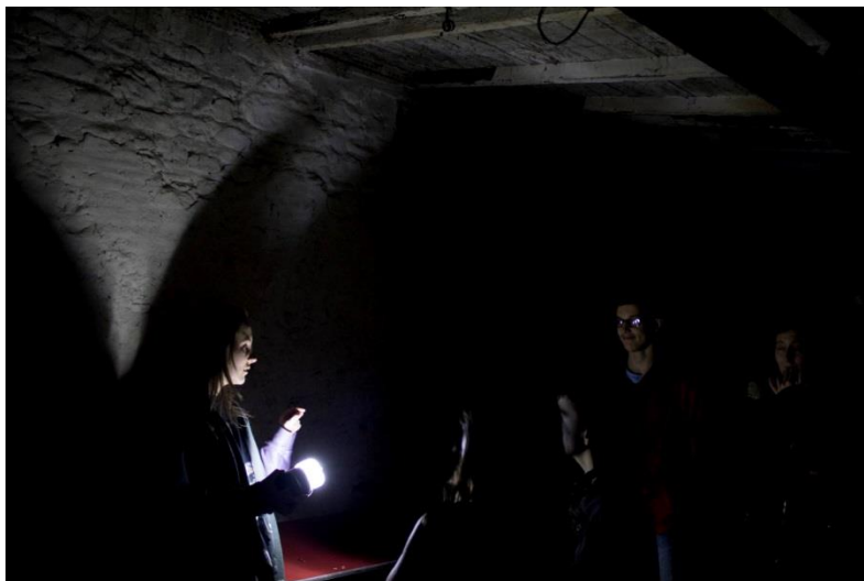
Figure 24: The final story in the barn...

Led away rapidly, the audience passes the gypsies who look anxiously into the crowd, searching for their evidently escaped victim. The hitherto headlong narrative now seems to be