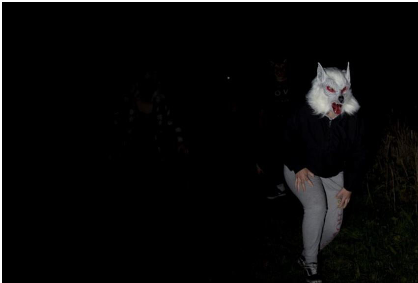
Figure 27: Run for your lives...!

‘hypermasculine’ and yet she also signals how monstrous hypermasculinity can reveal ‘the fragility of the category of masculinity and the ways in which such masculinity may be