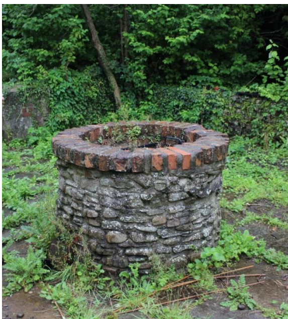
Figure 10: Forest Farm (daytime): the well

been mauled (Figure 9). The wound might be a clue as to what is to come: only one kind of creature could have caused those slash marks... The fact this remains unsaid is a storytelling