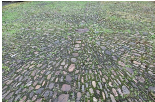
Figure 19: Forest Farm (daytime): the courtyard cobblestones