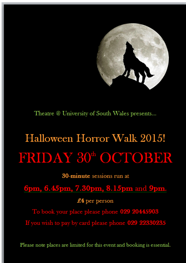
Figure 1: Poster for the 2015 Halloween event created by the Drama Department at the University of South Wales for Cardiff City Council

As Sconduto indicates, the werewolf can inhabit the wooded areas that border or surround the urban domain, precisely as Forest Farm does. For our audience, it is a short and simple