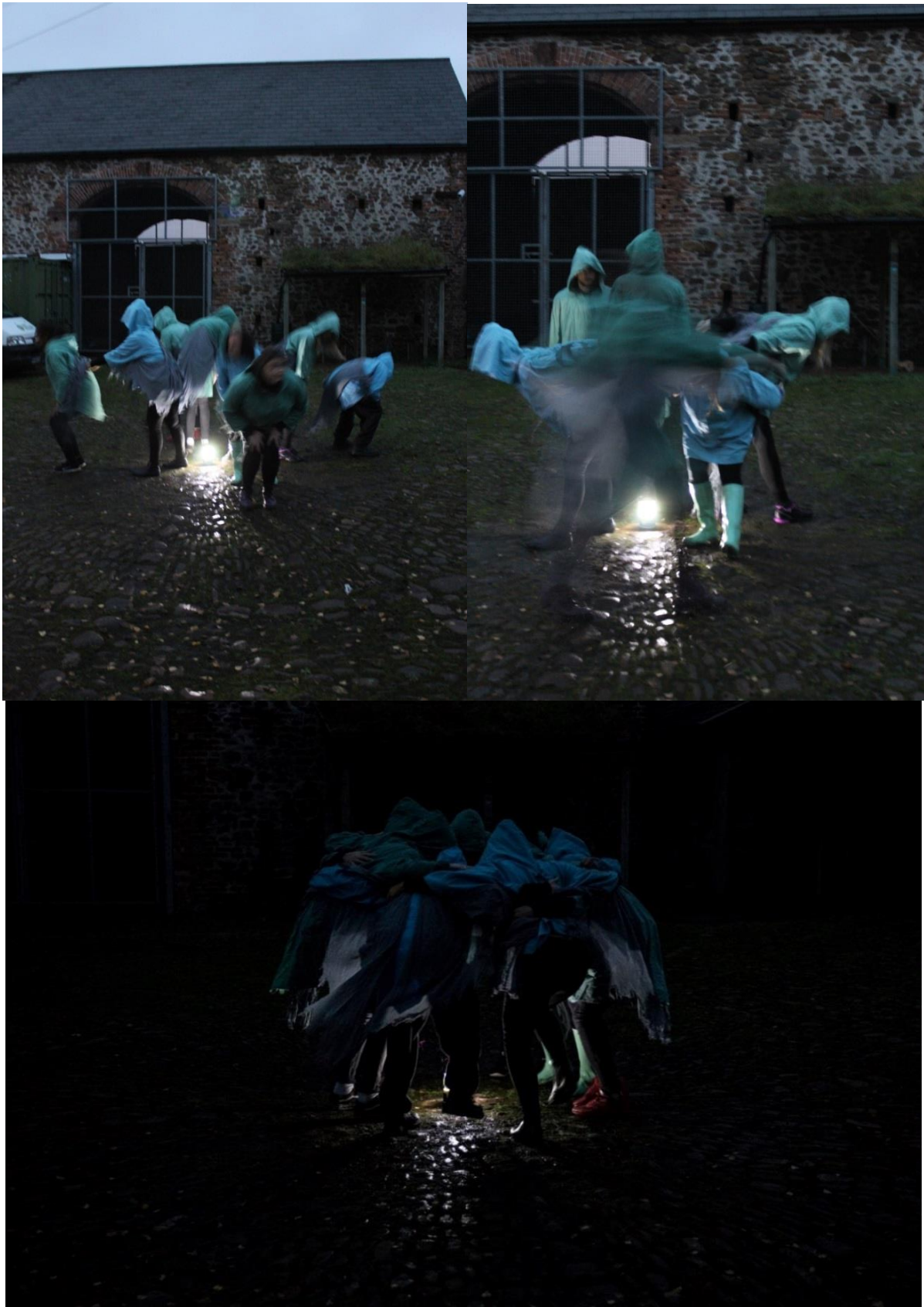
Figures 20-22: The Moon Ritual Dance